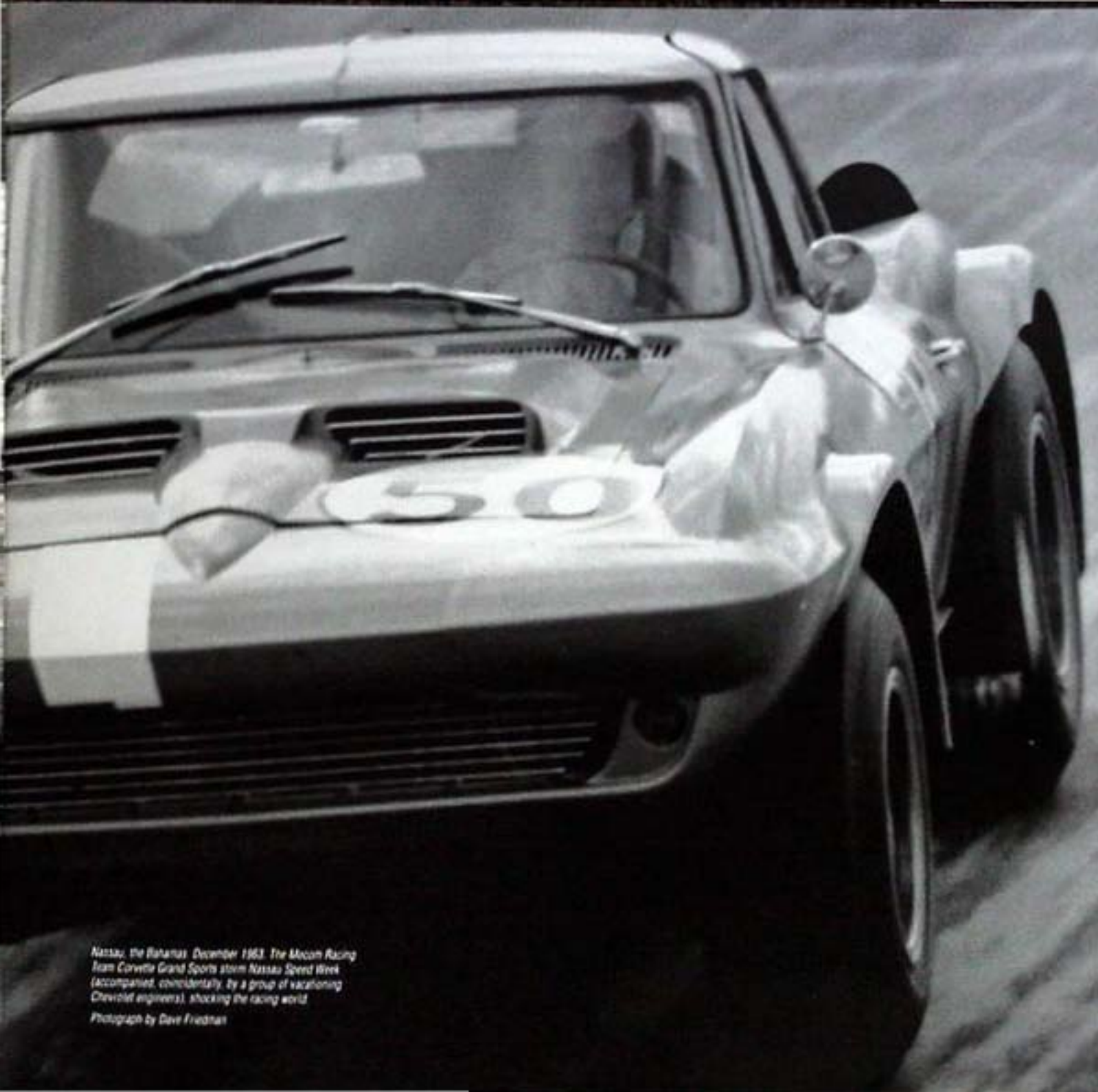
Nassau, the Bahamas, December 1963. The Mecom Racing Team Corvette Grand Sports storm Nassau Speed Week (accompanied, coincidentally, by a group of vacationing Chevrolet engineers), shocking the racing world.