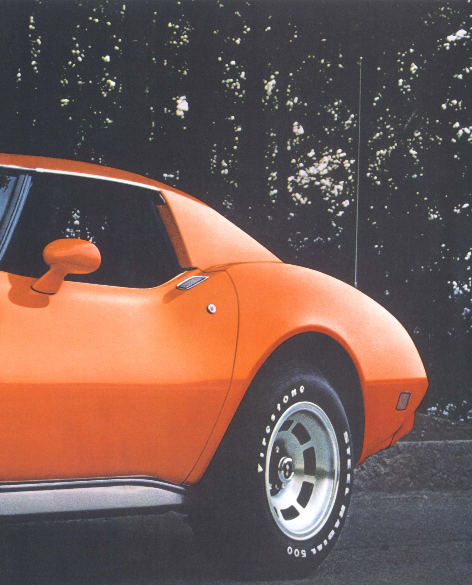
Corvette Coupe. Shown with available sport mirrors, AM/FM radio, cast aluminum wheels and white lettered tires.